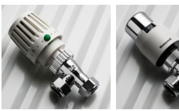
A variety of body sizes based on the same modern fluted design