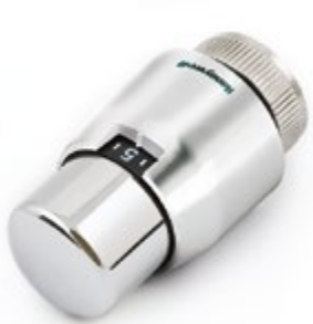
Classic Chrome Head