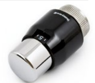
Classic Brushed Chrome Head